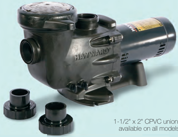
1-1/2" x 2" CPVC unions available on all models.

Max-Flo II provides exceptional value by building upon the outstanding reputation of the original through updated features such as CPVC unions, an elevated motor base and a larger leaf holding capacity strainer basket. For a great pool experience every time, count on Max-Flo II.